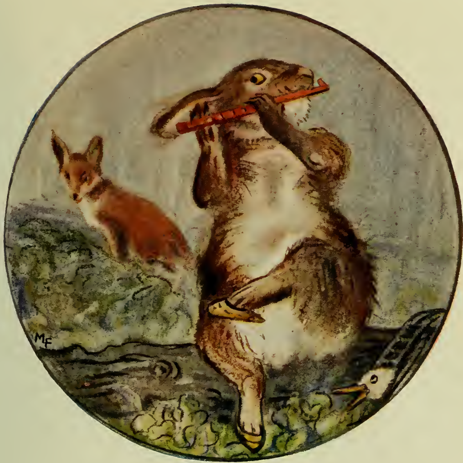
SO DUCK CRAWLED UNDER THE OVERTURNED BASKET AND SAT VERY STILL